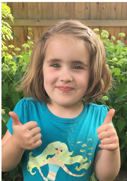
Georgia was born with ADPKD.

There are two types: autosomal dominant PKD and autosomal recessive PKD.